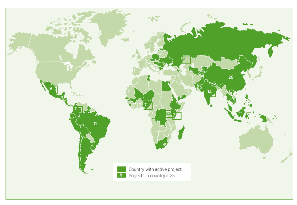
Figure 3 Active World Bank carbon finance projects