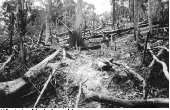
Figure 3. Slash-and-burn agricultural land preparation method in Ghana.

In Africa and Asia, even though in some case wild fires had been ignited for apparently no valid ecological reasons, the use of fire had been and is still an integral part of land use and livelihood systems. Fire is used for field preparation in slash-and-burn agriculture (Figure 3) on which majority of the rural people depends to meet energy and food needs.